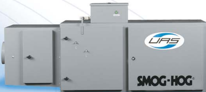
SHN-10 with optional inlet plenum