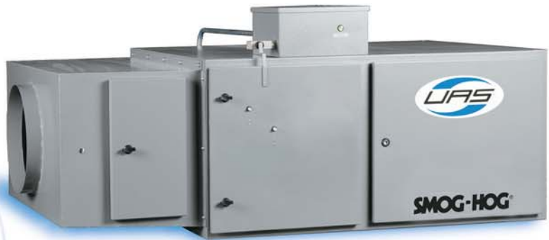
SHN-20 with optional inlet plenum

...equipped with airflow capacities ranging from 400 to 9,000 CFM.