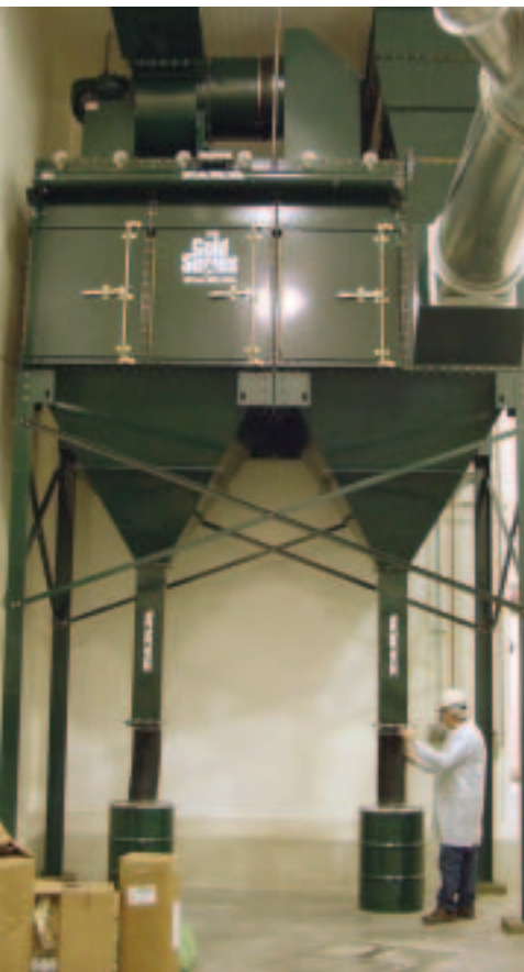
GS24 with top mount fan and vertical explosion vent