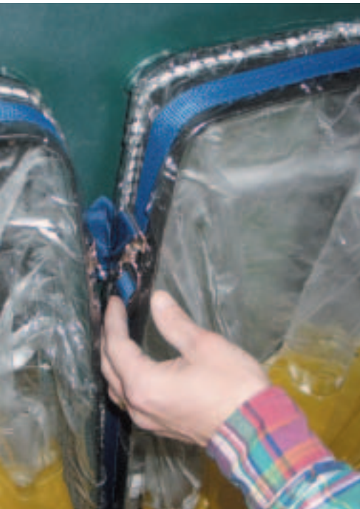
BIBO Filter Access